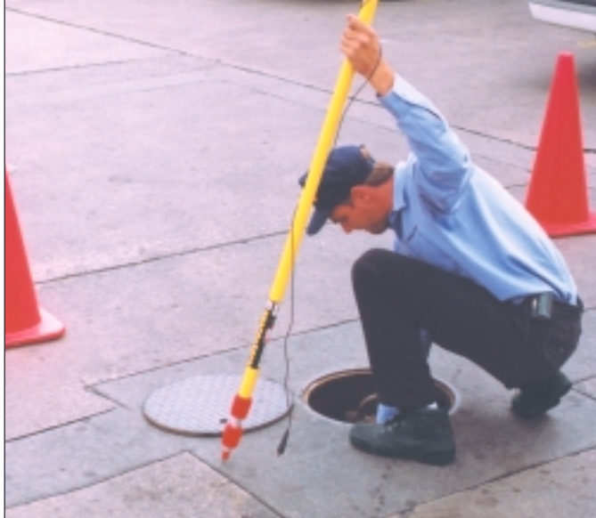
Corrosion technician prepares to make tank connection for reading tank-to-soil potential to evaluate cathodic protection system performance.

too much current for the anode to protect the flex connector. Larger magnesium anodes may be required in some instances if electrical isolation of the flex connector is not completed.