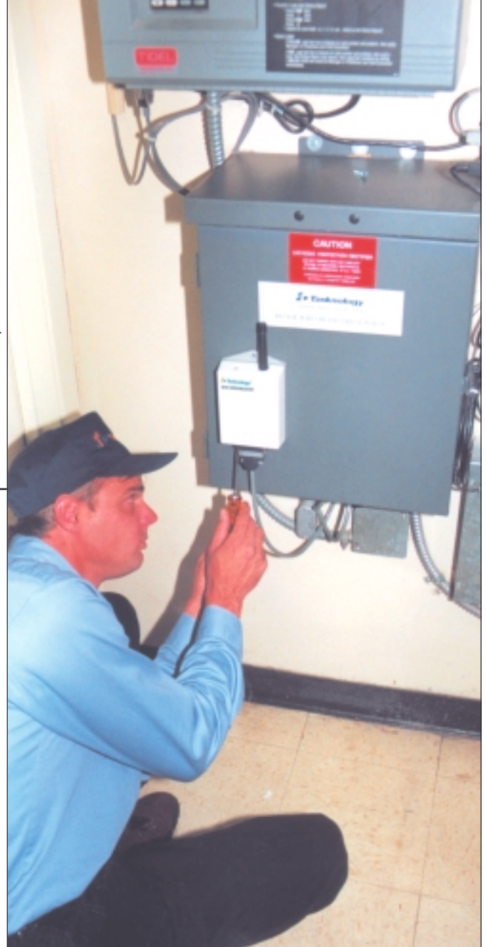
Corrosion technician finalizes installation of cathodic protection system remote monitoring unit.

Therefore, an entire buried external metallic surface can be forced to become cathodic and it will not corrode because it becomes cathodically protected. Cathodic protection is defined as “the reduction of corrosion rate by shifting the corrosion potential of the electrode toward a less-oxidizing potential by applying an external electromotive force.” The anodes around the tanks are the external forces that corrode by forcing current to the ground and onto the tanks (cathode).