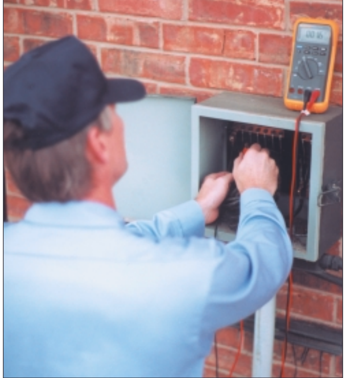
Corrosion technician reads individual anode output at the junction box to evaluate operation of the cathodic protection system.

Potential readings should be obtained in several areas around the tank and piping system to insure proper protection. It is important to take readings at both ends and the middle of the tank because it is possible that CP can be achieved at one end and not the other. The same is true for metallic piping. Readings should be taken at both ends and the middle of the piping run to insure proper protection levels because each